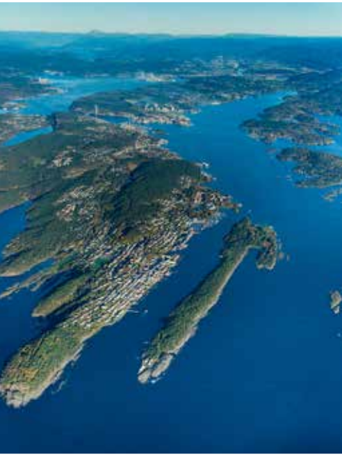
From Langesund in the south to Gaustadtoppen in the north

Bamble is a very attractive county in every way possible. It's big enough for you and me, and you get to know it quickly. Jobs are available in Bamble and in Grenland in general - Porsgrunn, Skien or Siljan. It will only take you a few minutes to get to Porsgrunn and Skien, and the buses run every 15 minutes. Kragerø is not far away from Bamble and the road connections to Vestfold are good, the highway E-18 runs through the county.